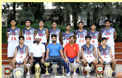
School Basketball Team (Senior)