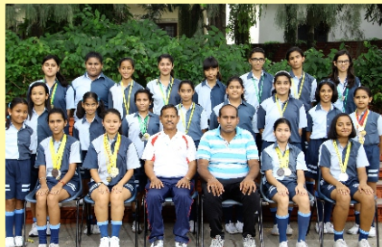
School Swimming Team (Girls)