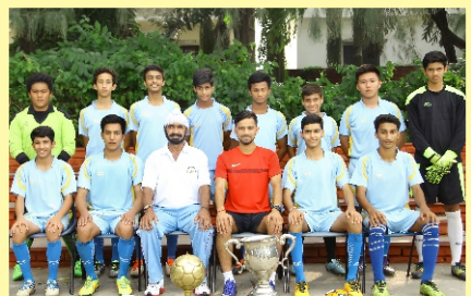
School Football Team (Senior)