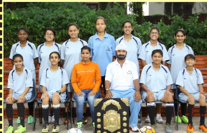
School Football Team (Girls)