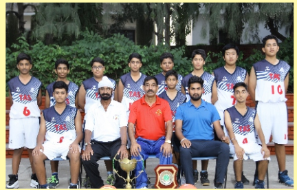
School Basketball Team (Junior)