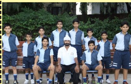
School Skating Team