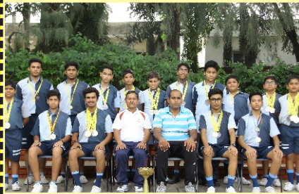
School Swimming Team (Boys)

The Asian School is the proud winner of all the trophies in field of sports for the year 2016 - YOU NAME IT & WE HAVE IT.