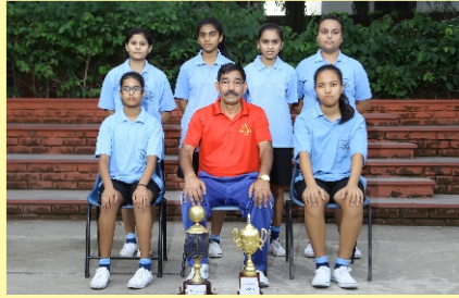
School Badminton Team (Girls)