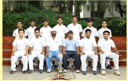
School Cricket Team (Senior)