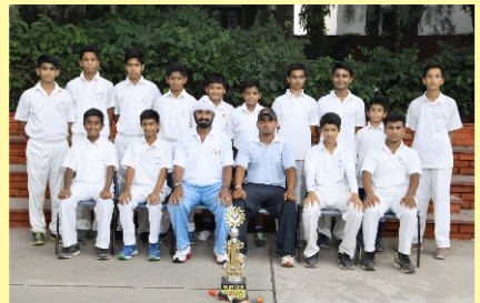
School Cricket Team (Junior)