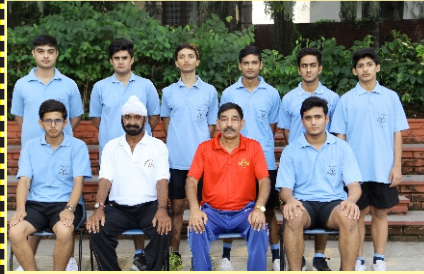
School Badminton Team (Boys)