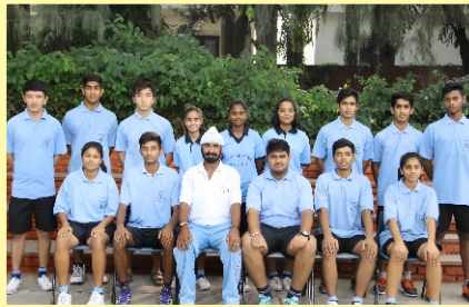
School Athletics Team