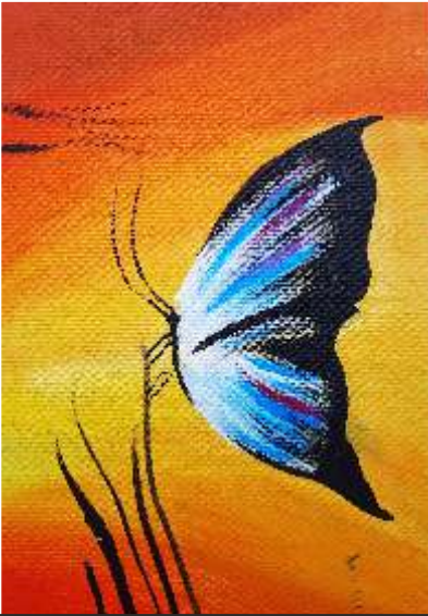
Kabir Singh - 12C