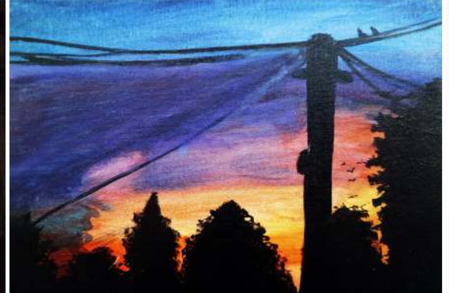
Pradhuman - 12E