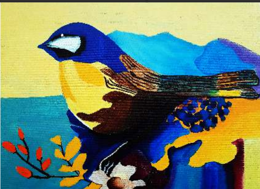
Khyati Ganguly - 12B