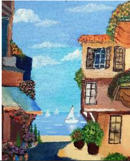
Surbhi Bhatnagar - 12B