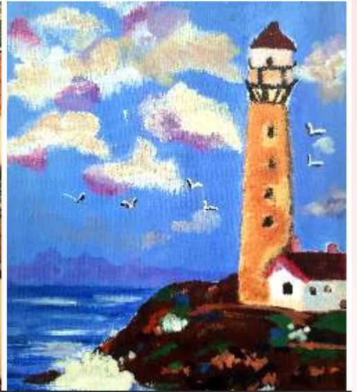
Nayasa Thakar - 12B