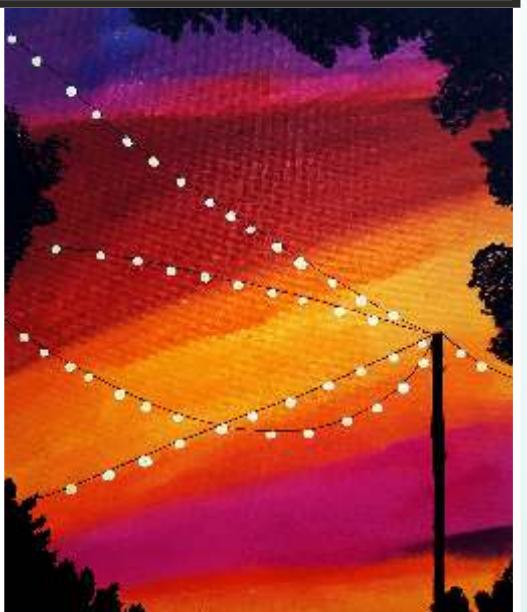
Jiya Bhalla - 12C