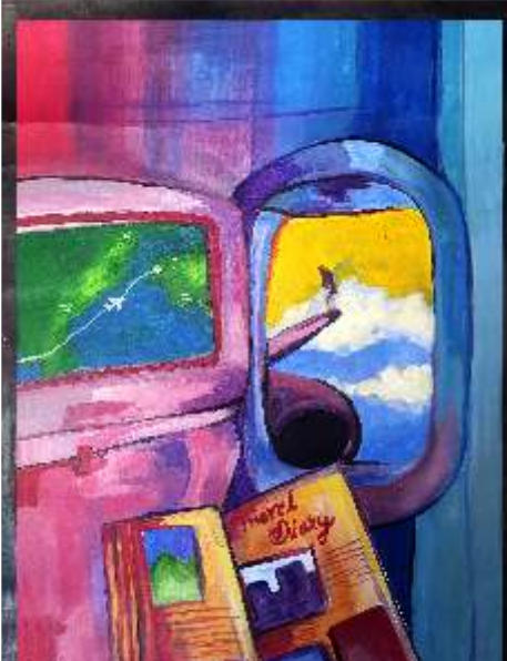
Ameya kulshrestha - 12F